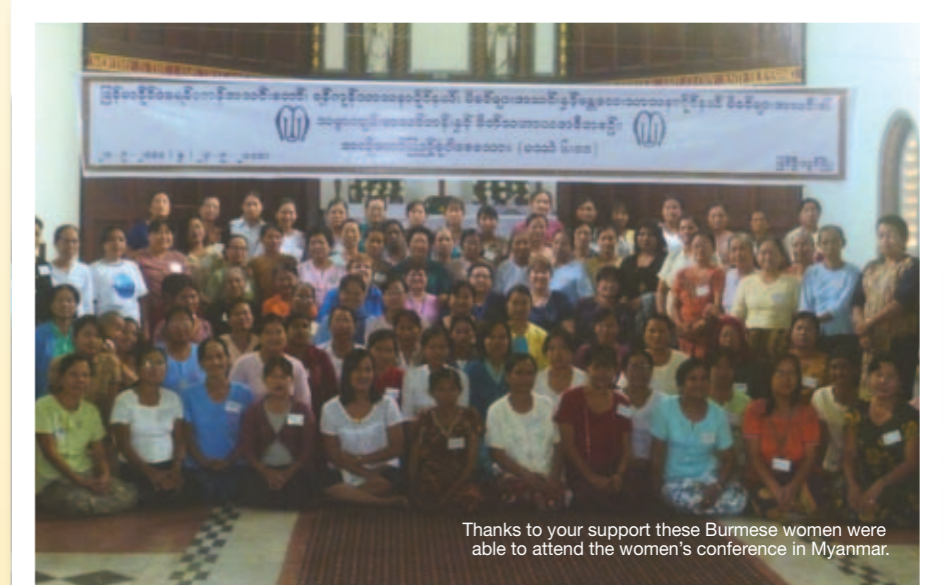
Thanks to your support these Burmese women were able to attend the women's conference in Myanmar.

Thank you very much for your love and all your support. We really appreciate it. We can now know what is right and teach it in the villages.