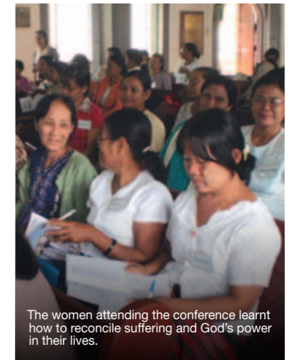
The women attending the conference learnt how to reconcile suffering and God's power in their lives.