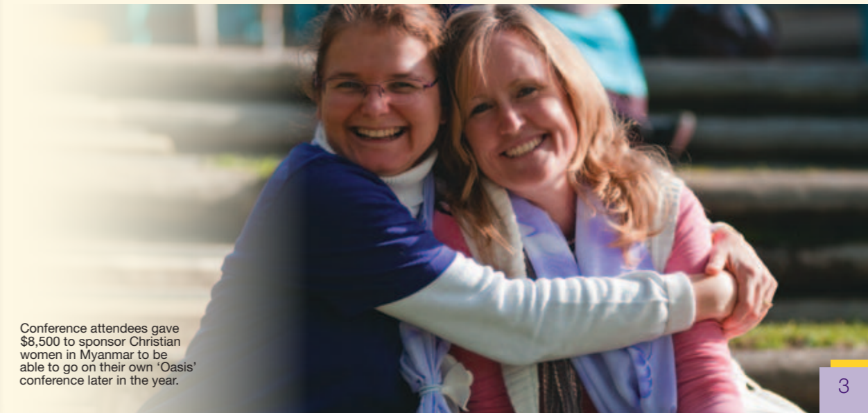
Conference attendees gave $8,500 to sponsor Christian women in Myanmar to be able to go on their own 'Oasis' conference later in the year.